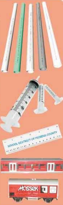
[H = Height 高度 # = Effective print area (for reference only)有效的印刷范围 (只用作参考)]