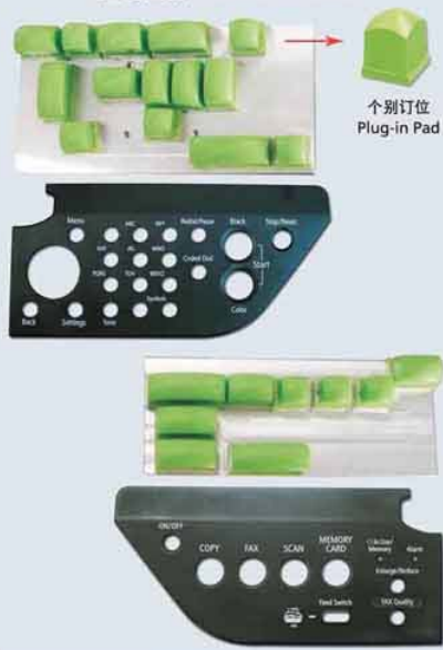
控制面板 / Control Panel