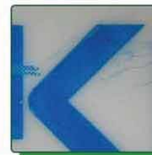
传统胶头 - "拉丝"问题 Hairline problem