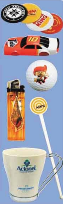
[H = Height 高度 # = Effective print area (for reference only)有效的印刷范围 (只用作参考)]