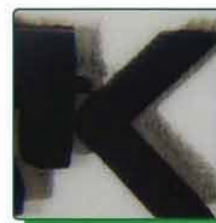
传统胶头 - 有鬼影问题 Ghost shadow