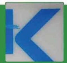
防静电胶头 - 防静电功能 Solved by Anti-static pad