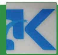
防静电胶头 - 韧性强，能受高压 Solved by Anti-static pad