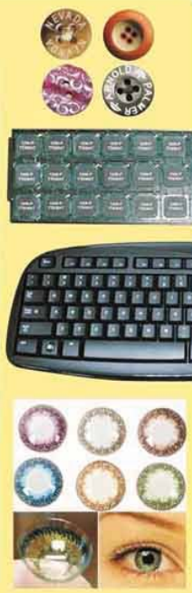
[H = Height 高度 D = Diameter of each cavity 直径 # = Effective print area (for reference only)有效的印刷范围 (只用作参考)]