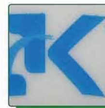
传统胶头 - 胶头变形问题 Print distortion