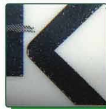
传统胶头 - 沙孔问题 Pinhole problem